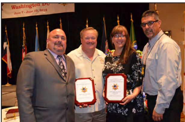
** TDCJ Region II Director's Office and California SATF & State Prison received their Lifetime Sponsor Plaques at Project 2000 XXIII. A proud moment for all!