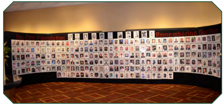
Photo: The Wall of Honor. On it are the photographs of every Fallen Corrections Professional that the CPOF has honored and those from the past whose line-of-duty deaths have been brought to our attention by Supporting Members and others, or whose deaths we have discovered through our own research.