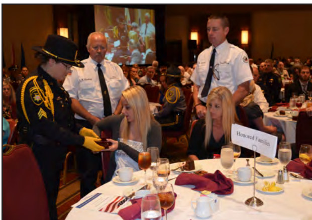
Each family received three mounted shell casings from the 21-gun volley fired earlier in the day in honor of the Project 2000 XXIII Fallen Officers.