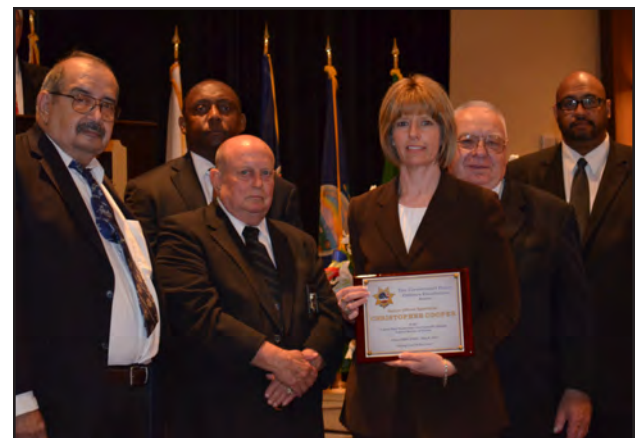
The home institution or office of each Fallen Officer receives a plaque for display at the facility.