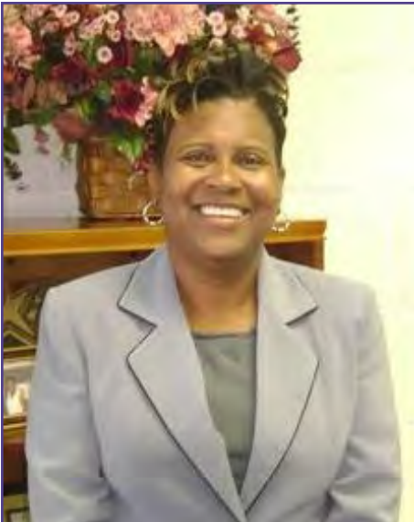
Warden Shirley Avent EOW: January 27, 2011